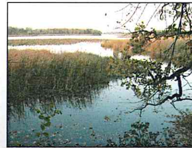
South of the Yahara River

Disclaimer: The user of this brochure should maintain appropriate judgment and decisions while hiking on trails. The contributors of this brochure are not responsible for the actions of the individual.