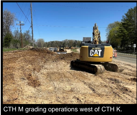
CTH M grading operations west of CTH K.