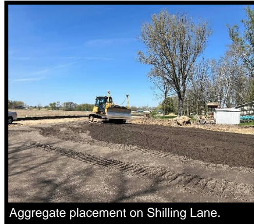
Aggregate placement on Shilling Lane.