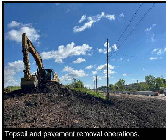
Topsoil and pavement removal operations.