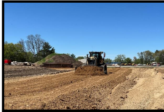
Grading operations for the new North Shore Bay Drive configuration.